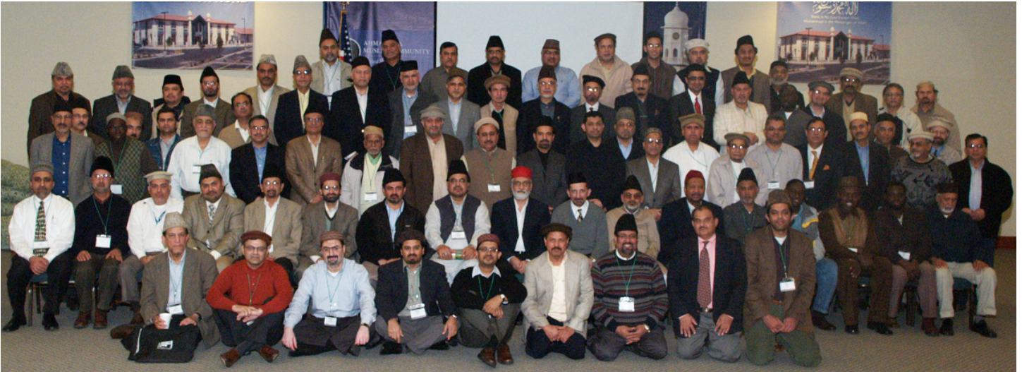
Group photo at Ansar Leadership Conference held in LA East Majlis at Bait ul Hameed Mosque on January 23-24, 2010

To donate, please visit http://usa.humanityfirst.org , call 877-99-HFUSA (877-994-3872), or mail your checks to: Humanity First USA, 300 E. Lombard Street, Suite 840, Baltimore, MD 21202.